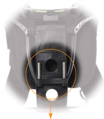
FENZY Quick-Fix system

The FENZY Quick-Fix system allows the use of all kind of cylinders and can quickly transform a single cylinder SCBA into a twin-cylinder SCBA.