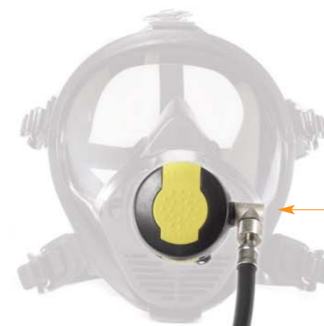
FENZY SX-Pro demand valve

New first breath demand valve with positive pressure